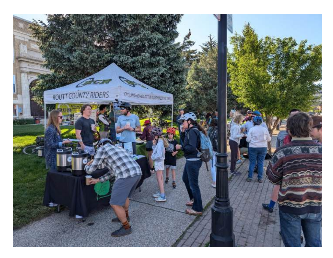
Bike to Work Day Breakfast - June 2024

Please be in touch with us to discuss in-kind partnership more!