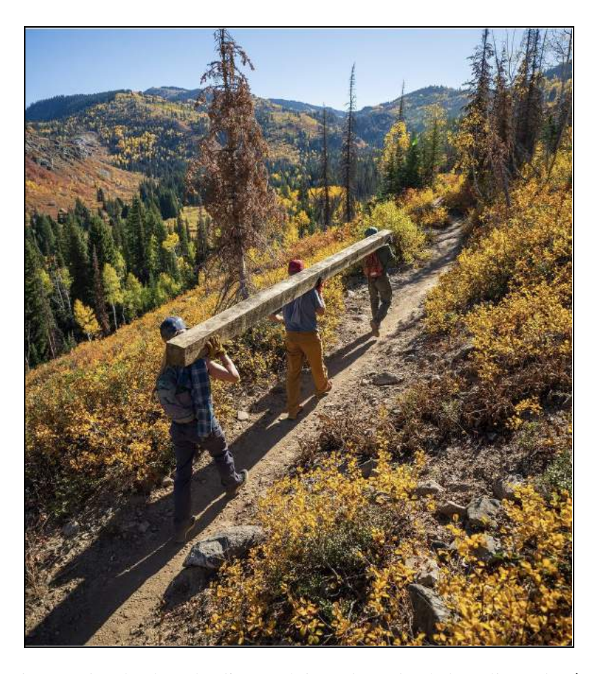
Volunteers lugging boardwalk materials up the Soda Ditch Trail, October '23